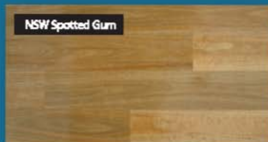
NSW Spotted Gum