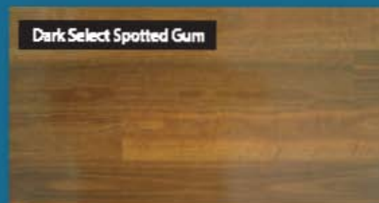
Dark Select Spotted Gum