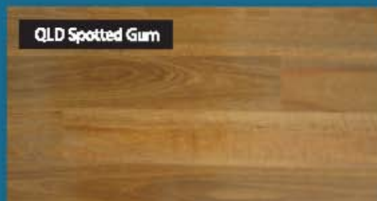
QLD Spotted Gum